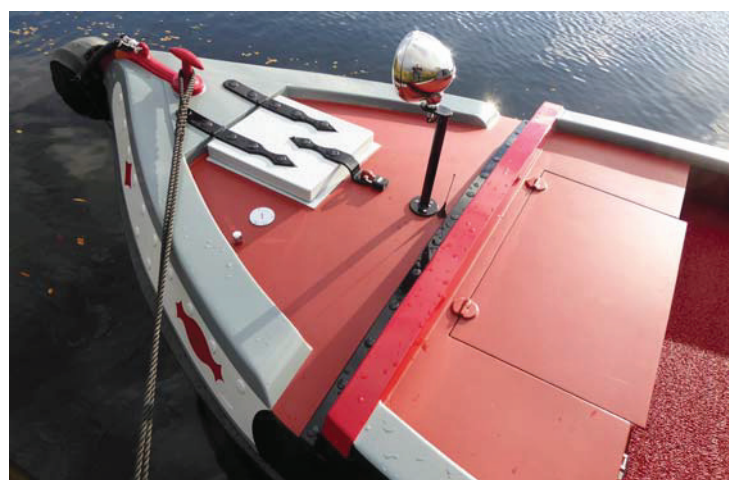
Lid on locker opens to reveal sound insulated man cave with Vetus 4kva raw water cooled generator.