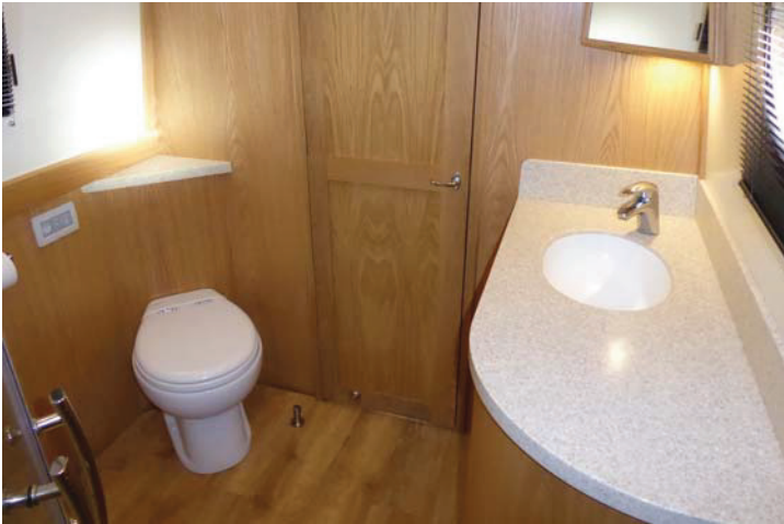
Walk-through bathroom with corian worktops and corian inset hand basin