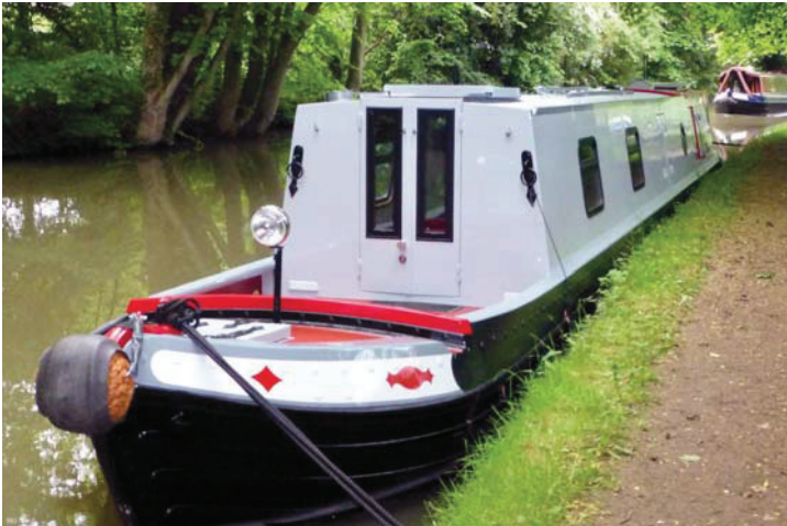
Traditional Jasher style bow with lowered tug style deck.