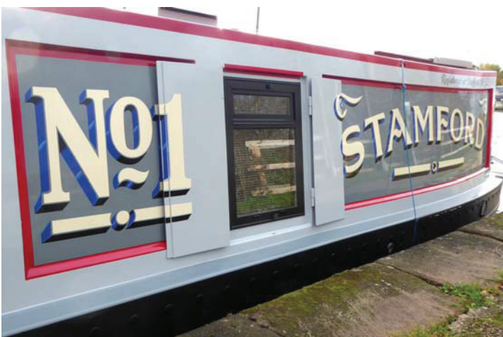
What look like engine room doors open to reveal double glazed with thermal break windows.