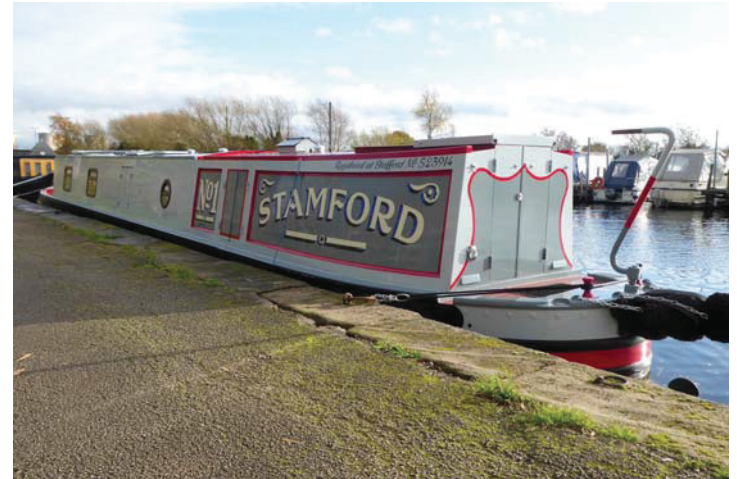
Stamford, a very modern traditional narrowboat.