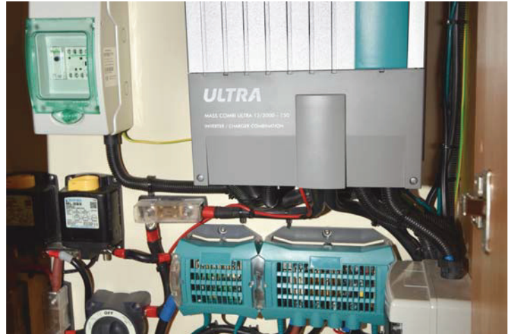
A glimpse of just some of Stamford's high specification onboard electrical equipment.